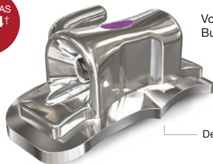
Votion® Bondable Buccal Tubes