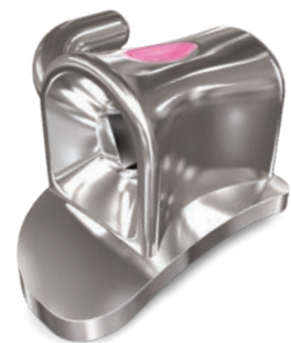
Votion® Mini Bondable Buccal Tubes